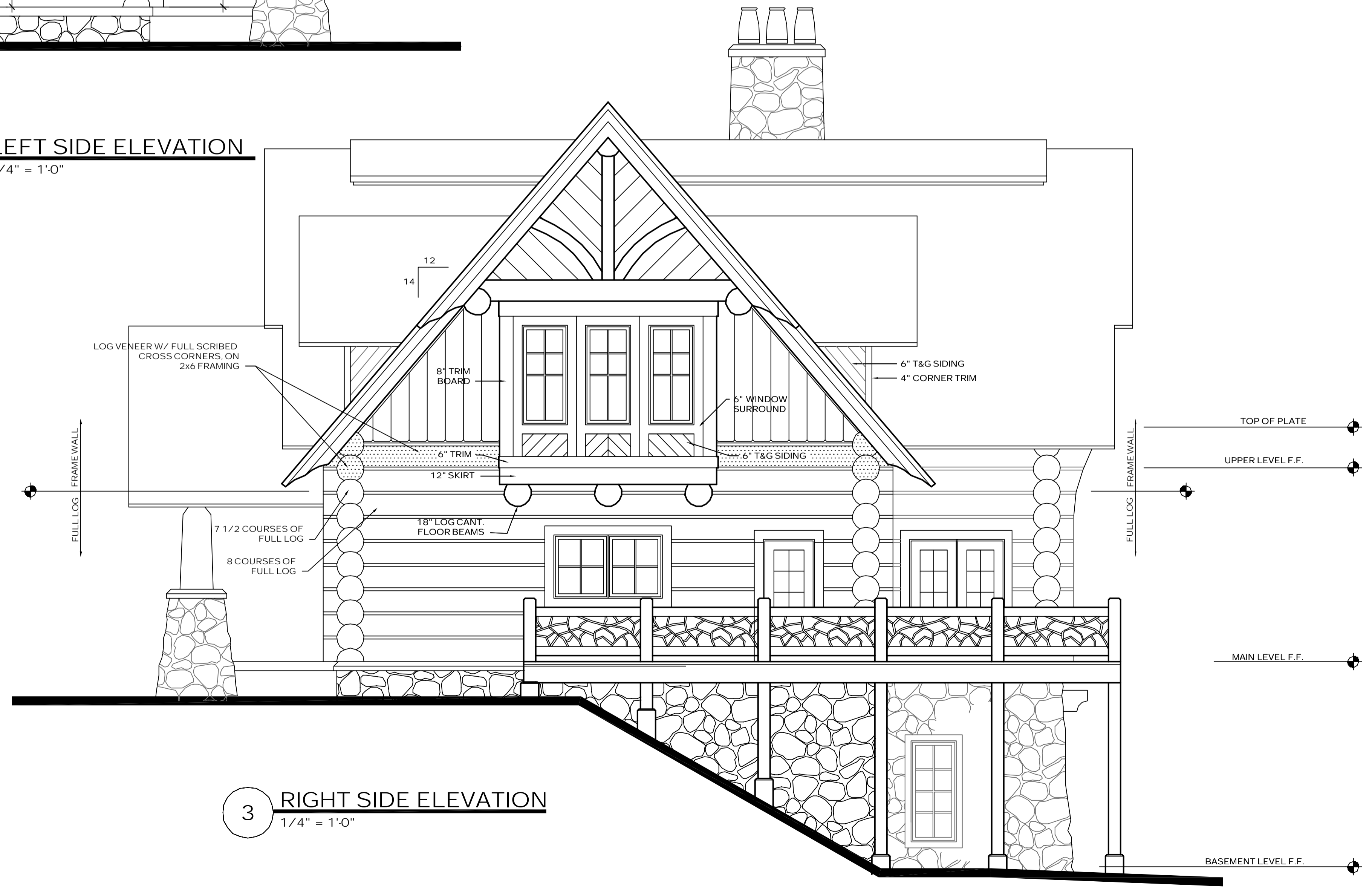
3 RIGHT SIDE ELEVATION 1/4" = 1'-0"