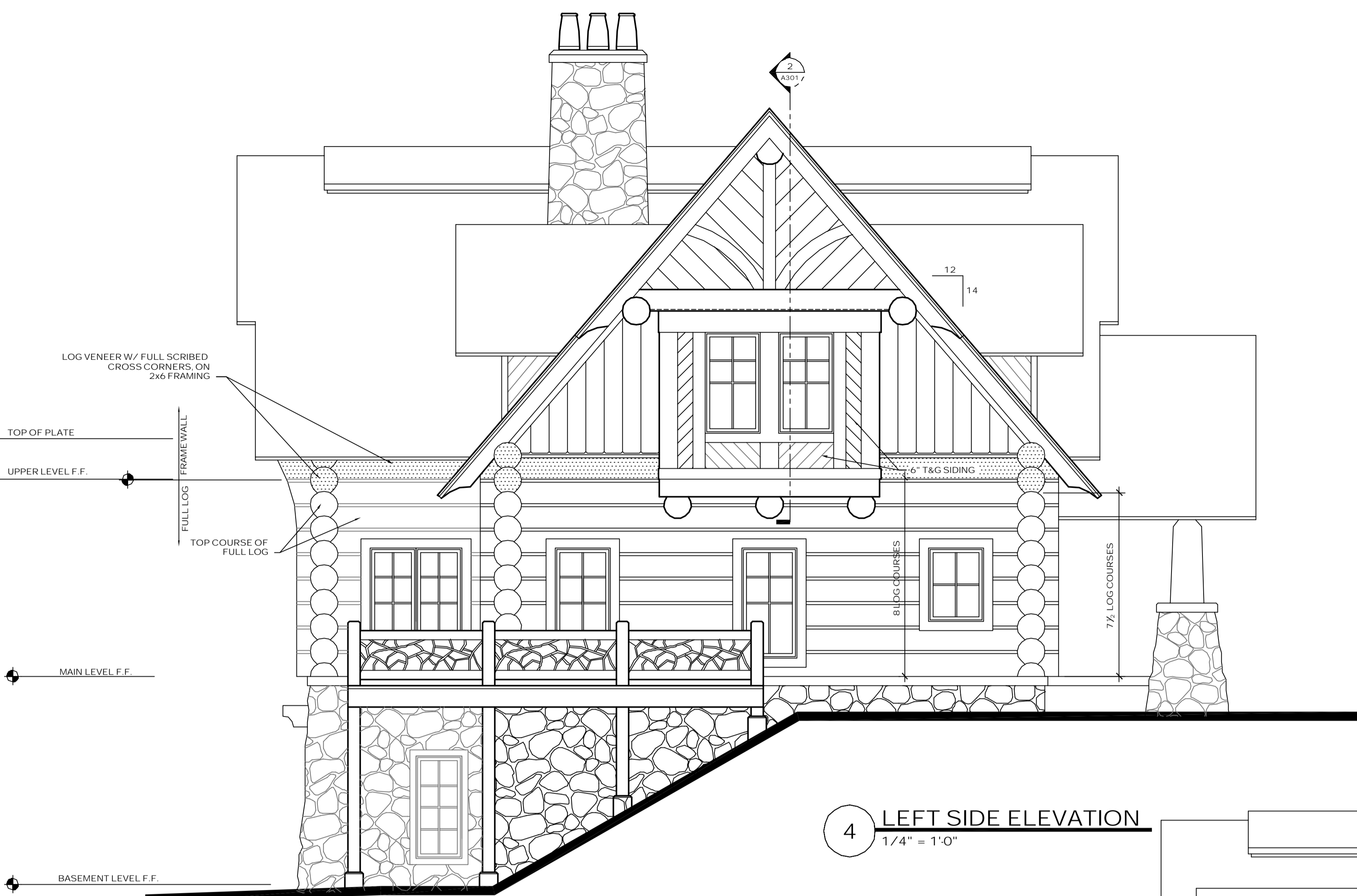
4 LEFT SIDE ELEVATION 1/4" = 1'-0"