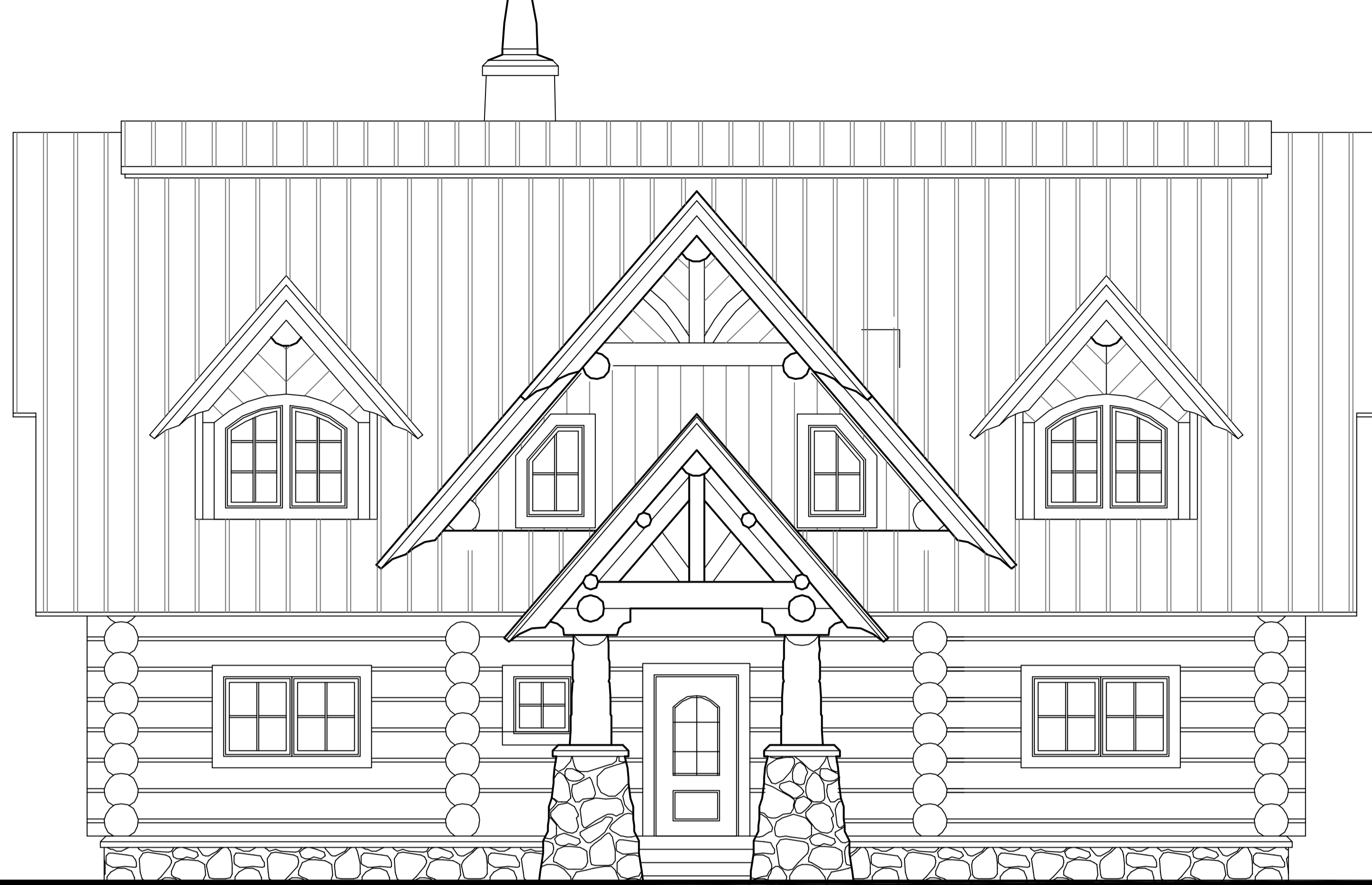
1 FRONT ELEVATION 1/4" = 1'-0"