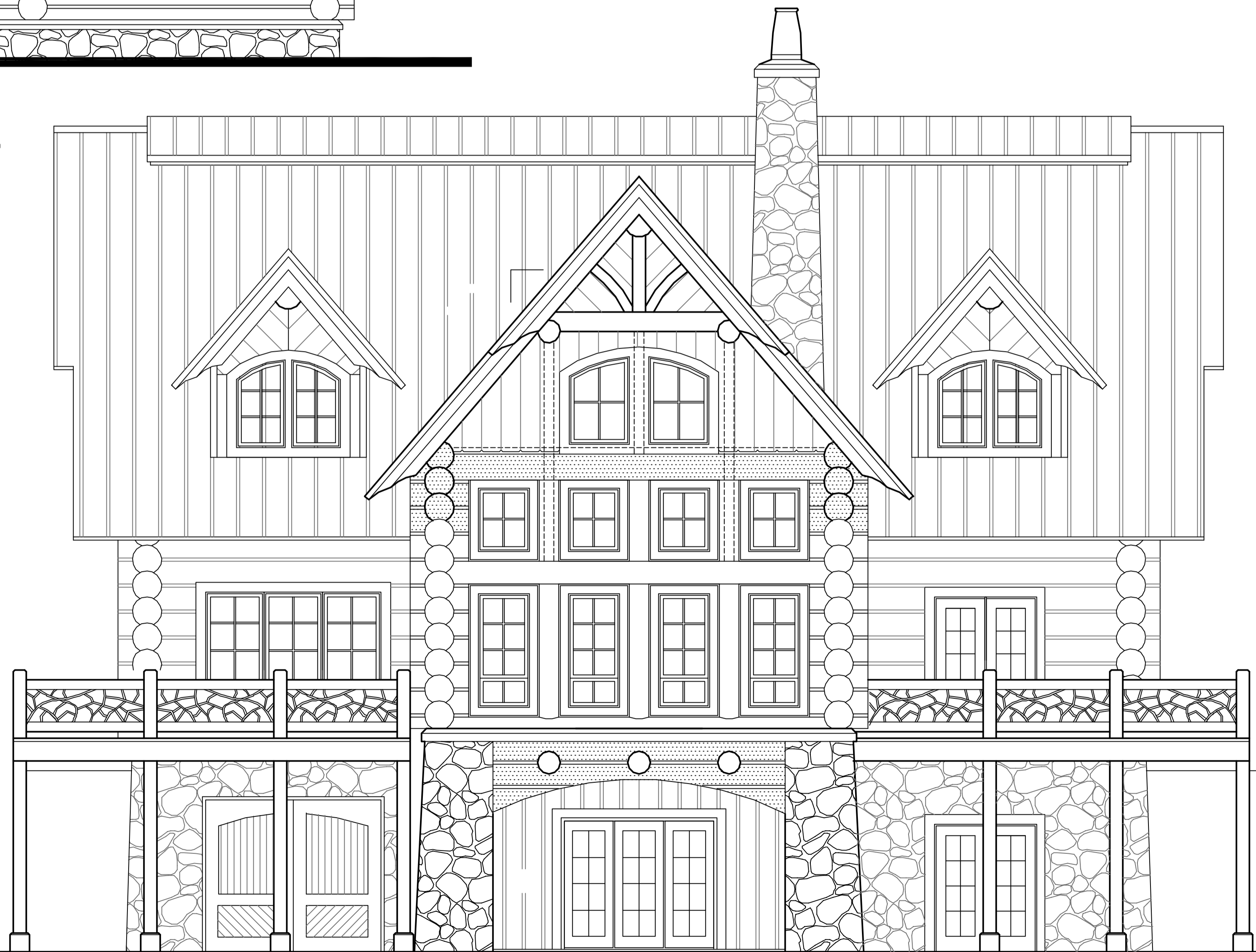
2 REAR ELEVATION 1/4" = 1'-0"